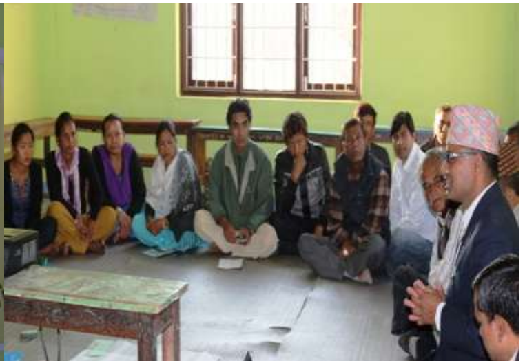
Orientation program on National Land Use Policy, Lele of Lalitpur