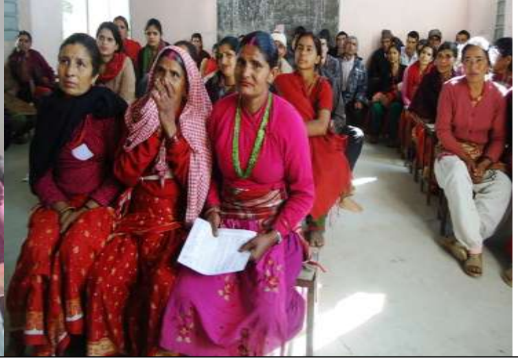
Interaction program on Joint Land Ownership, Kaleshwor VDC of Lalitpur