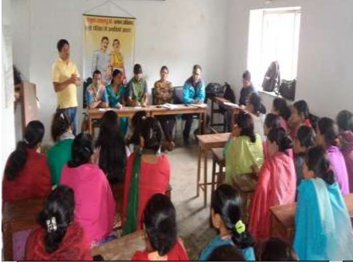
Orientation program on Joint Land Ownership Campaign