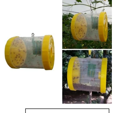
Cue Lure Trap